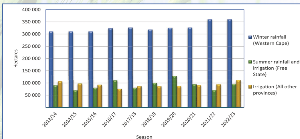
Graph 3: Area planted per production area over ten seasons

The area utilised for wheat production increased by 8% to 566 800 hectares compared to the 2021/22 season. Hectares cultivated under wheat in the Western Cape were the same as the previous season, while the wheat production area in the Free State increased by 37% year on year. Nationally, dry land and irrigation areas increased by 5% and 17% respectively year on year. Please see Graph 3.