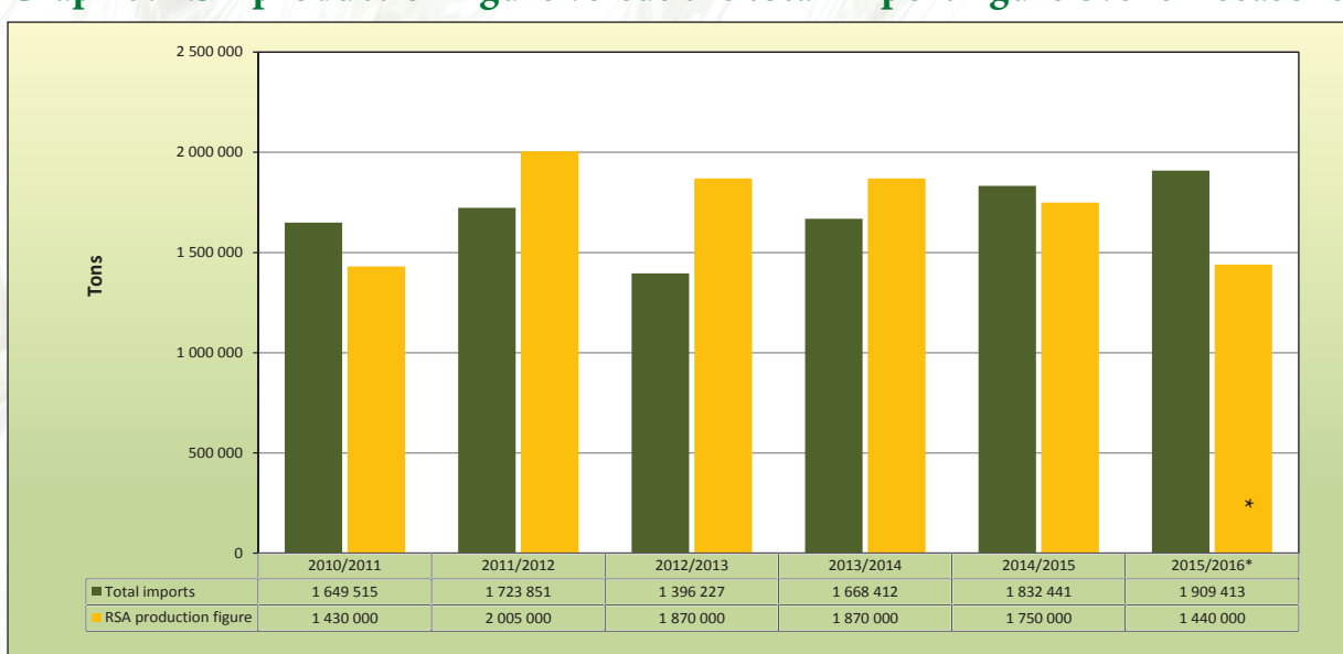
Graph 5: RSA production figure versus the total import figure over six seasons

The amount of wheat imported for local consumption so far during the 2015/2016 marketing season, amounts to 1 909 413 tons according to SAGIS. This figure includes imports up until 2 September 2016. The marketing season commences on 1 October every year.