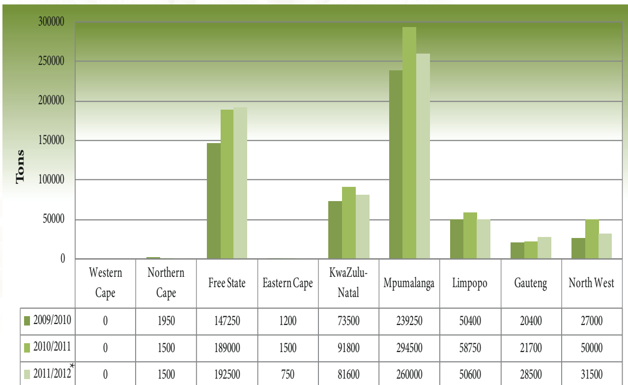
Graph 2: SOYBEAN PRODUCTION FIGURES PER PROVINCE OVER THE LAST 3 SEASONS

Final production estimate figures obtained from the Crop Estimates Committees (CEC)